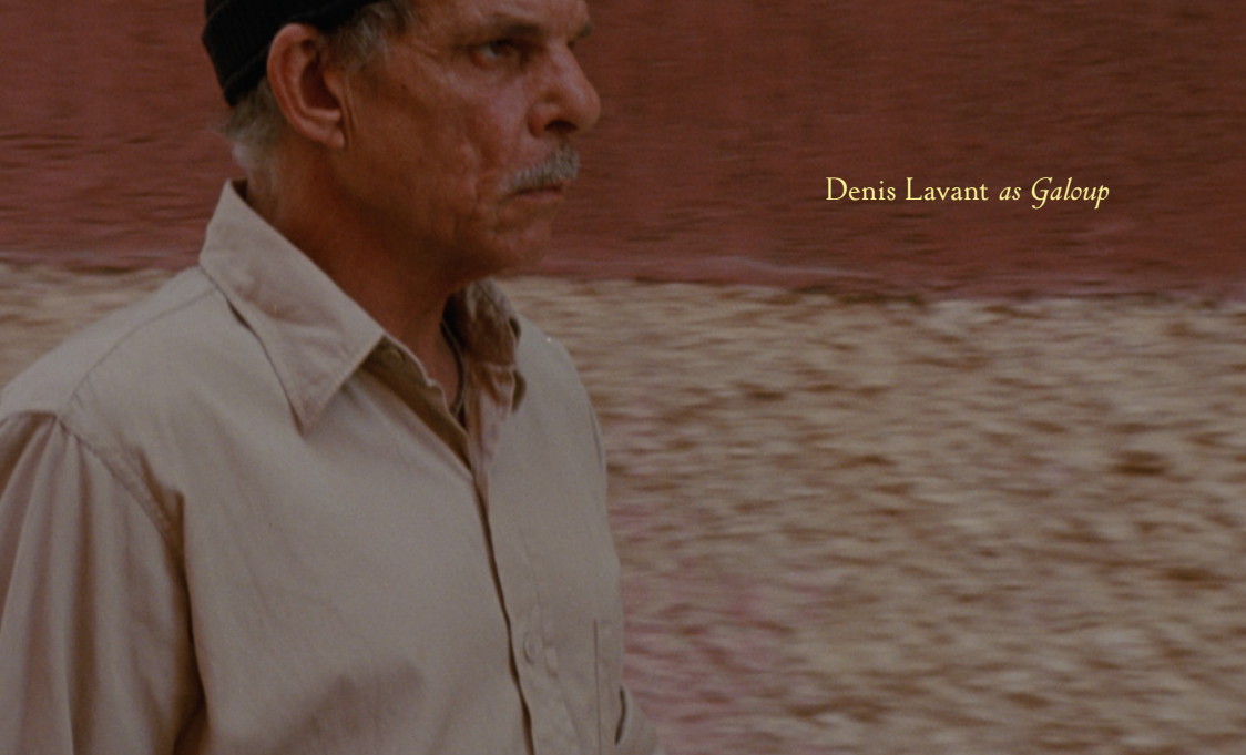
Denis Lavant as Galoup